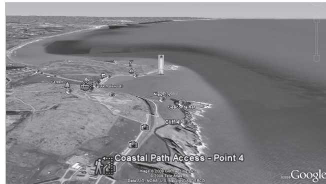
Figure 5. Virtual Fieldtrip of Ythan Estuary in Google Earth

educational and training context, can be used as the basis for developing virtual fieldtrips or as a ground-truthing resource. Two simple examples are used here for illustration. The first is a local information system developed for the Ythan Estuary in North East Scotland, UK, which is also used to provide a virtual fieldtrip and tour of the estuary and the sand dune system. The second example is the use of Google Earth to create a local information system for Nigg Bay to the south of Aberdeen that is also used as the basis to create a multimedia coastal footpath walk, and a visual fly-through of the Bay as the basis for visualizing a proposed waterfront regeneration proposal (Figure 5). Although Google Earth has some limitations as a Geographical Information System (GIS) mainly in terms of its functionality, it has considerable potential to provide a relatively simple way to bring together and display spatial data and information, and to share the data and information without the need to have a GIS. Google Earth also allows for layering on top of an image back drop, the addition of more layers, and incorporates a DEM (Digital Elevation Model). The popularity of Google Earth is increasingly evident from the number of data providers who are now willing to share their GIS data layers in the KMZ format; for example, Scottish Natural Heritage (SNH), and the Maritime Coastguard Agency (MCA), and by the number of GIS software packages that now allow the export of data