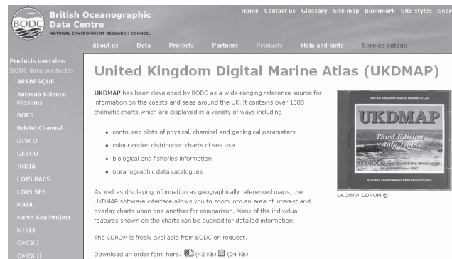
Figure 1. Screen snapshot of the UKDMAP