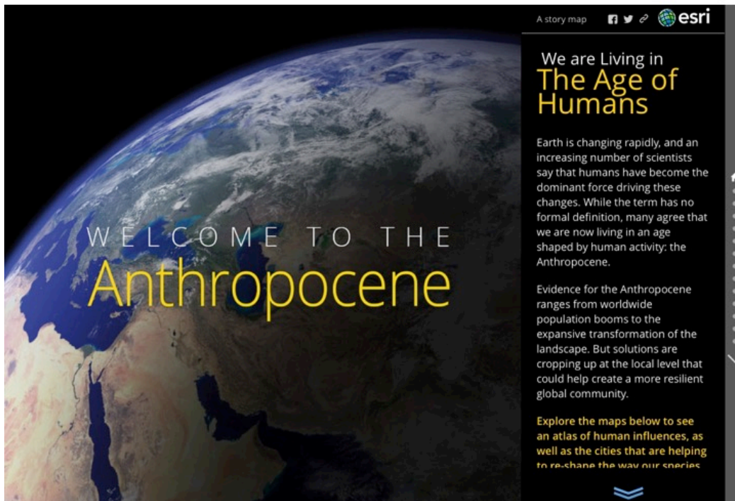
Figure 3. The opening page of a story map about the Anthropocene. This story map draws upon an electronic atlas of the Anthropocene, available with descriptive metadata at http://arcg.is/1S7Nw1z . Resources for creating one’s own story map are at http://storymaps.arcgis.com .