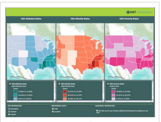
Using the new map comparison template, you can compare three ArcGIS Online maps side by side. Watch the video.

When you use the Identify tool in the ArcGIS.com viewer, information about features at the same location will display in all three maps. For example, if you pan and zoom to an area on one map, the other two will automatically adjust to the same extent and location. This will help you compare the information in the different maps at the same time and better understand several themes and the relationships among them. You also have the ability to modify the JavaScript source and adjust the template's look and feel, add your own tools, and much more.