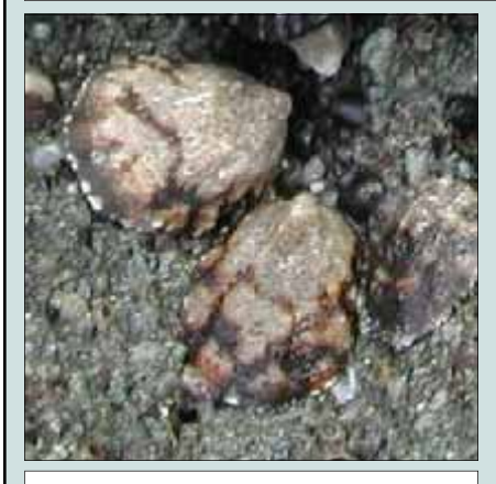
A common species, the finger limpet