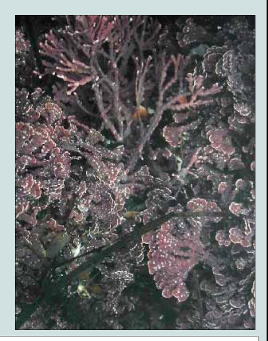
What may at first appear to be simply a pink rock (top left), is probably one covered with coralline red algae. While not a coral (which are animals), this plant resembles some corals (and also secrete a carbonate shell), hence its common name.