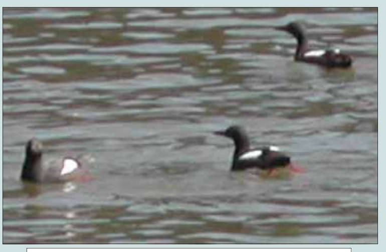
Pigeon guillemots ( Cepphus columba ) have black beaks, white patches on their wings and bright red feet.