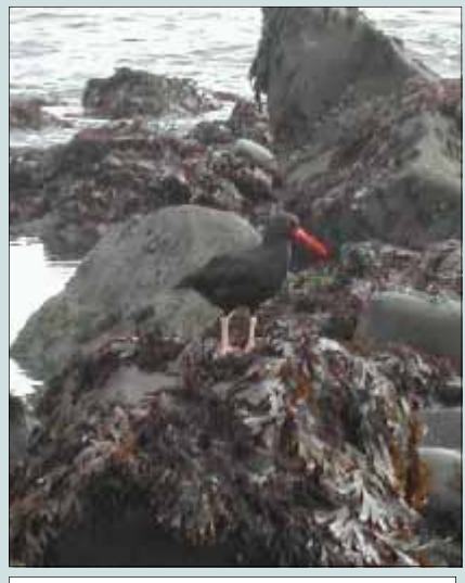
Black oystercatchers ( Haematopus bachmani ) are easily identified by their bright red eyes and beak.