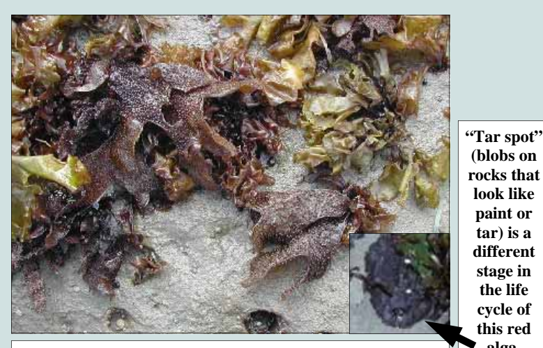
This species rough, towel like texture gives it the common name of Turkish washcloth. It is another member of the plant division, rhodophyta (red algae).