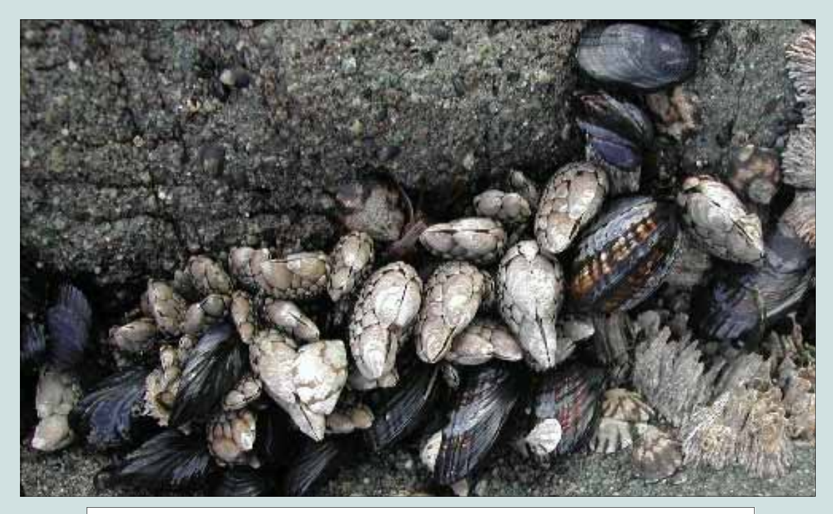
Common species in Oregon's rocky areas: blue mussels and gooseneck barnacles