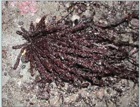
This species is known as black pine since it looks like pine needles. It is also a red algal species.