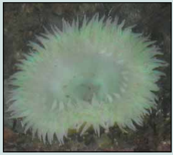
This close-up of a giant green anemone illustrates variation in their green hues