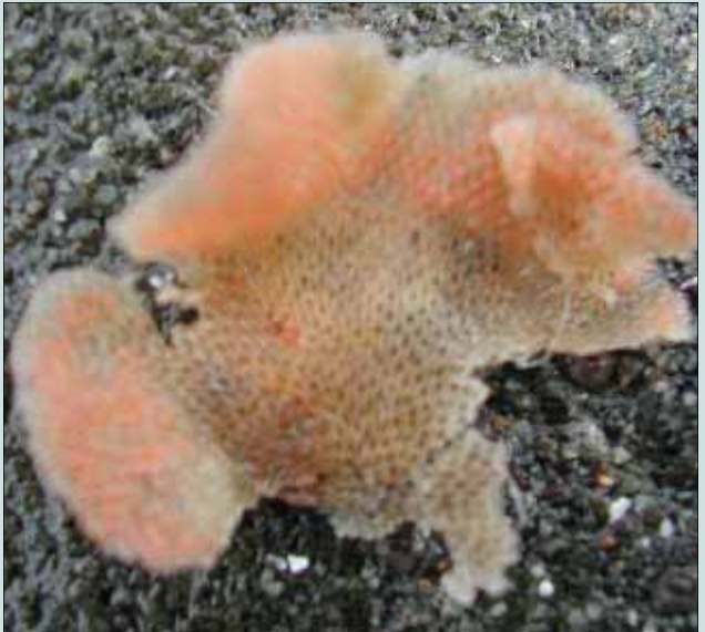
Other animals that may be confused with plants are bryozoans (aka moss animals). Some species are upright with branches that can look like small trees (left), while others are encrusting species (right) and grow flat.