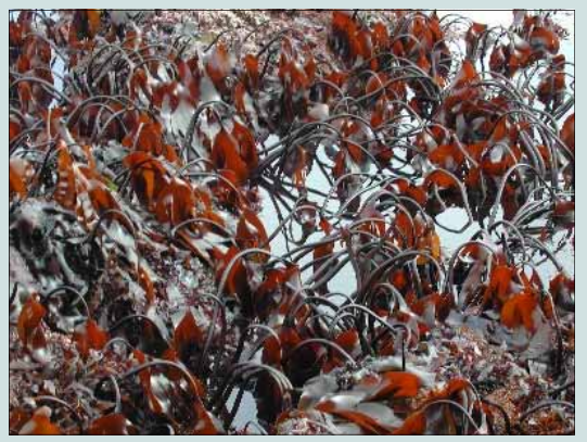
Beds of kelp (above) provide habitat for many rocky intertidal and subtidal species, including small fish.