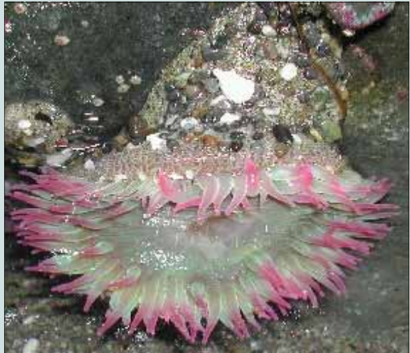
Close-up of an aggregating anemone. While they are often covered with small bits of shells and pebbles, once open, they show off their bright colors