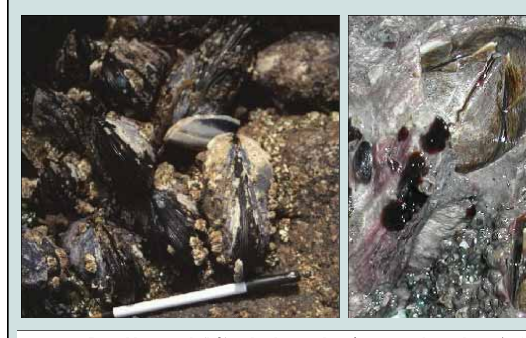
Large blue mussels (left) and a close up shot of a common barnacle species (right)