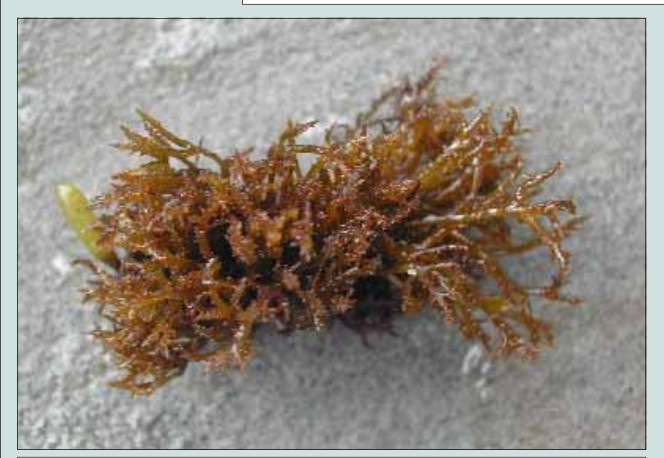
This branching marine plant is known commonly as nail brush seaweed which while it may appear brown is actually in the red algae group.