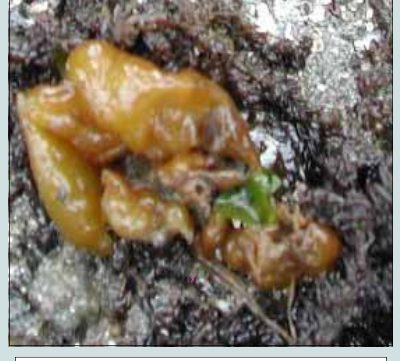
This species is known commonly as sea cauliflower or sea bugger.

Thin, green sheet-like algae is probably Ulva, or sea lettuce. It is very common in Oregon's rocky intertidal (not pictured here).