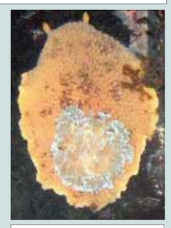
A lemon nudibranch aka sea slug