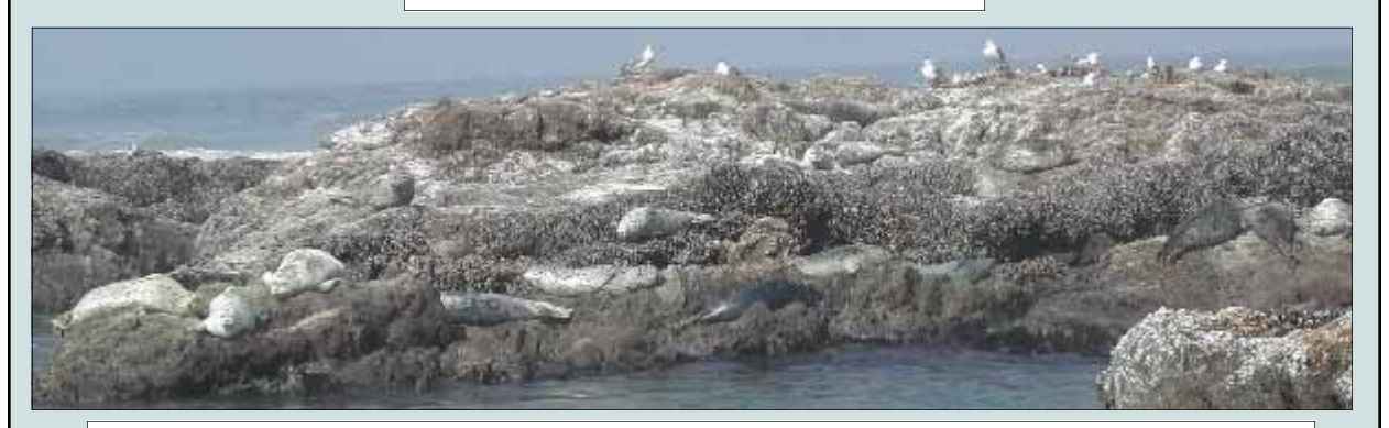
Marine mammals, like these harbor seals, often haul-out on Oregon's rocky shores. Please observe them from a distance as they are easily disturbed.