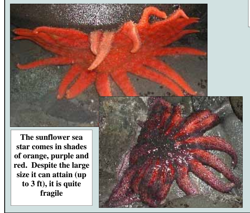
The underside of sea stars is covered with small tube feet, which they use for both attaching to rocks, moving around and feeding