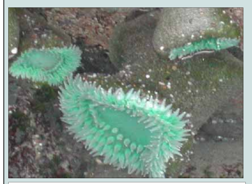
Giant Green Anemones get their bright coloration from symbiotic, single-celled algae living within them