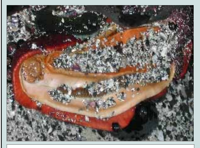
The underside of a gumboot chiton, the worlds largest chiton