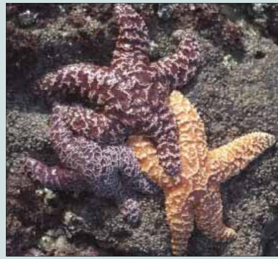
Close-up of ochre sea stars illustrating the variety of colors they exhibit. All three stars are the same species