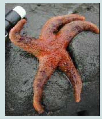
A smaller relative of the ochre star, the blood star lacks a spiny surface and comes in reds and oranges