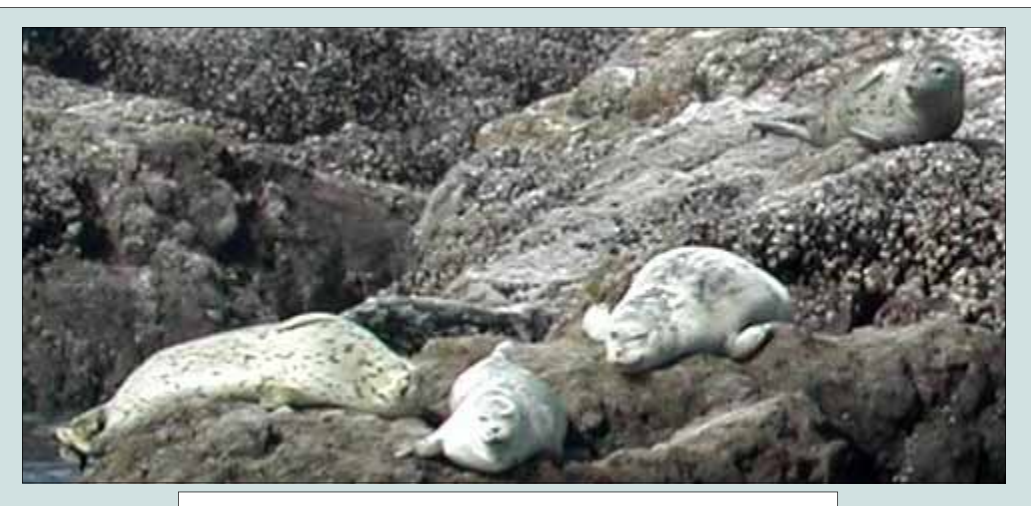
Harbor seals (Phoca vitulina) resting in the sun