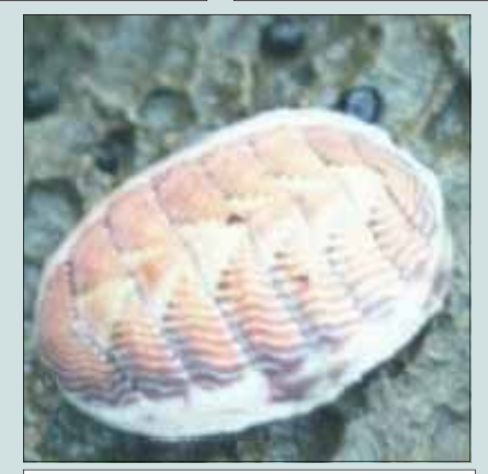
A small, colorful lined chiton