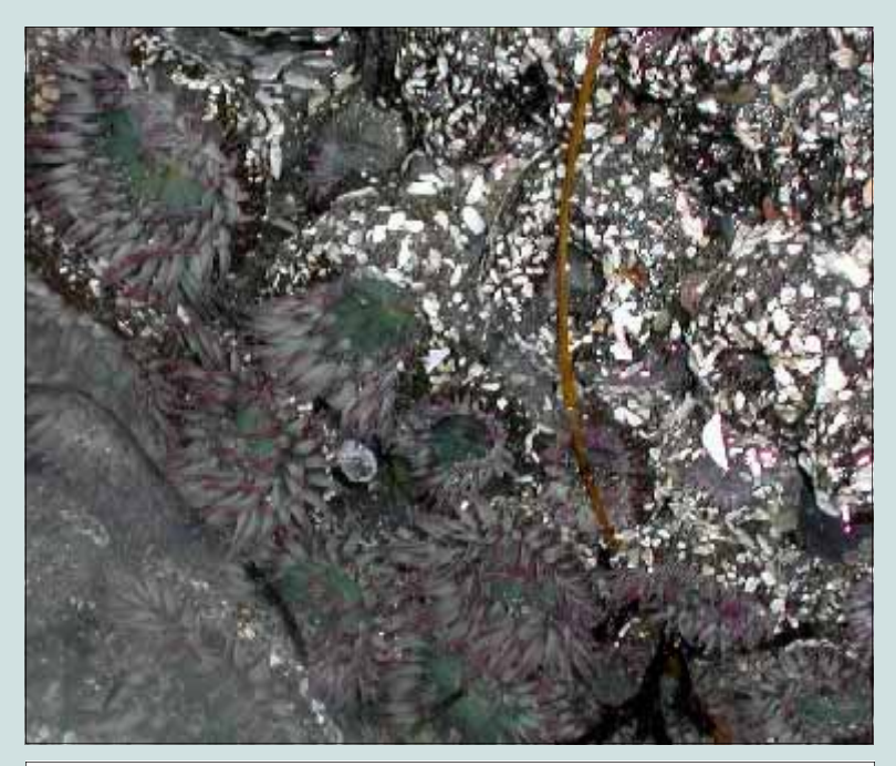
Aggregating anemones are clonal species, often occurring in large groups of genetically identical individuals