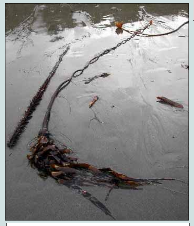
Feather boa kelp (left) and Giant Bull Kelp (right) often wash up on Oregon's beaches. They tend to grow in rocky subtidal areas.