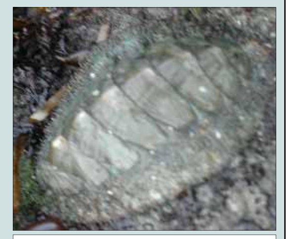
The mossy chiton gets its name from the bristles found along the edge of its plates