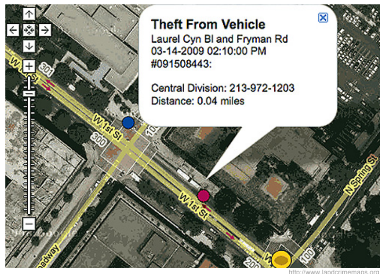
Many of the crimes attributed to the 200 block of West 1st Street on the LAPD's online crime map actually happened somewhere else.

The department's online map incorrectly showed many crimes downtown -- near City Hall and the police station -- when its 'geocoding' software couldn't interpret the true address.